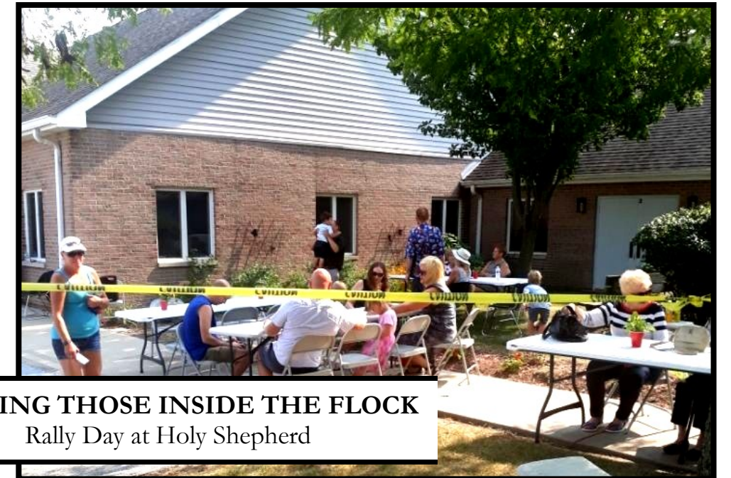
TENDING THOSE INSIDE THE FLOCK Rally Day at Holy Shepherd