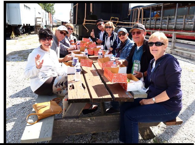
18 PrimeTimers in Attendance @ Hoosier Valley Railroad Museum

We ate a boxed lunch before the train ride & enjoyed coffee and pastry in town before heading home.