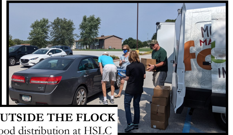
TENDING THOSE OUTSIDE THE FLOCK Mobile Marketplace & Food distribution at HSLC